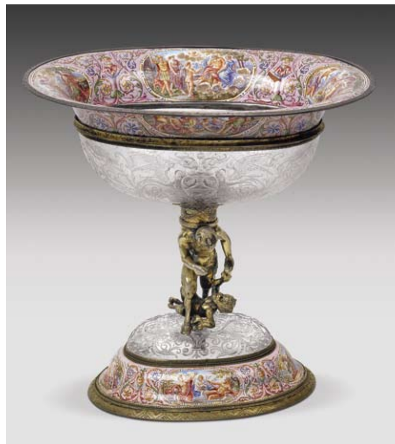
A rock crystal bowl, Vienna, Hermann Böhm, with enameled and silver-gilt mount, height 19.5 cm, € 7,000 – 9,000