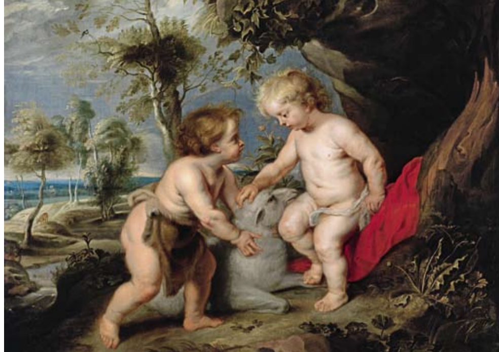
Peter Paul Rubens (1577–1640) and Studio, The Christ Child with the Infant St John, oil on canvas, 111.7 x 148.9 cm, € 100,000 – 130,000