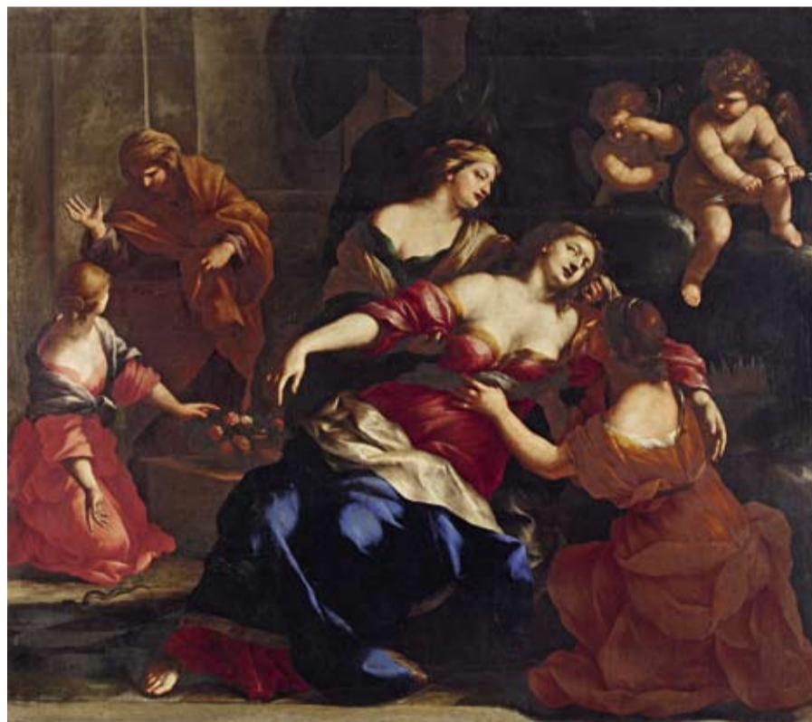
Giovan Francesco Romanelli (1610–1662), Death of Cleopatra , oil on canvas, 195 x 220 cm, € 100,000 – 150,000