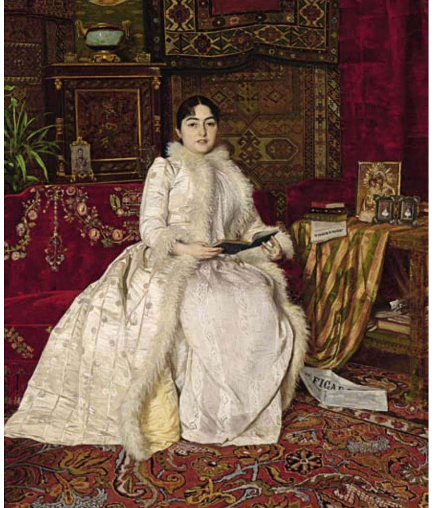
Uros Predic (1857–1953), Queen Natalia Obrenovic in Paris , 1890, oil on canvas, 58 x 44 cm, € 200,000 – 300,000