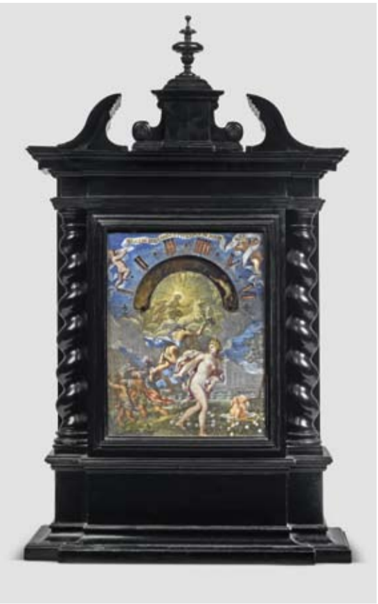
A Italian Baroque Night clock, Lodovico Manelli, Bologna, height 84 cm, 2nd half 17th cent., € 20,000 – 25,000