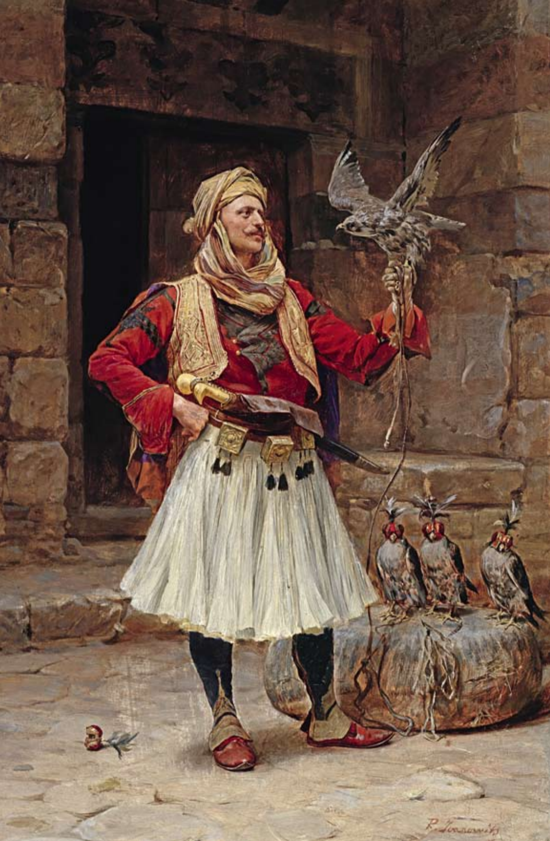
Paul Joanowitch (1859–1957), The Falconer , oil on panel, 45 x 30 cm, € 40,000 – 60,000