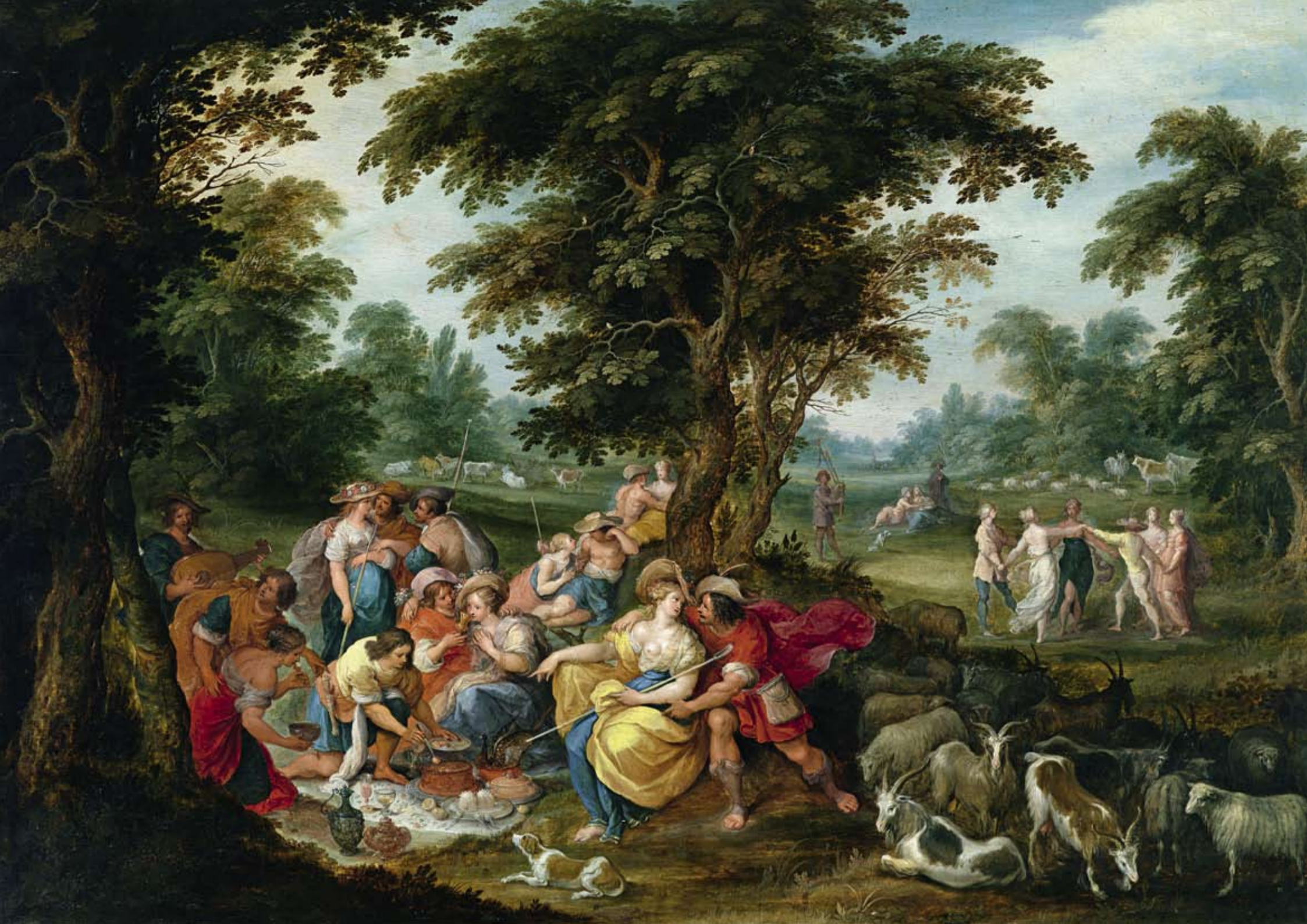
Frans Francken II (1581–1642), Ambrosius Francken II (after 1581–1632), Hans Jordaens III (ca. 1595–1643), Abraham Govaerts (1589–1626), Alexander Keirincx (1600–1652), Arcadia – The Golden Age, oil on panel, 72.7 x 104.4 cm, € 400,000 – 600,000