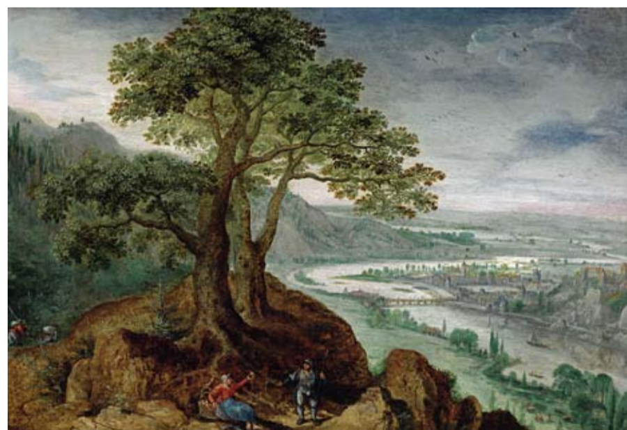
Lucas van Valckenborch (1535–1597), View of the Danube and the City of Linz, oil on panel, 22.5 x 33 cm, € 40,000 – 60,000