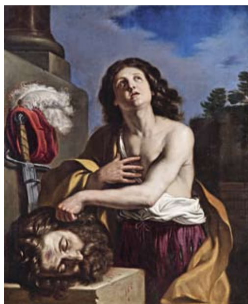
Giovanni Francesco Barbieri, il Guercino (1591–1666) and Studio, David and Goliath, oil on canvas, 100 x 120 cm, € 150,000 – 200,000