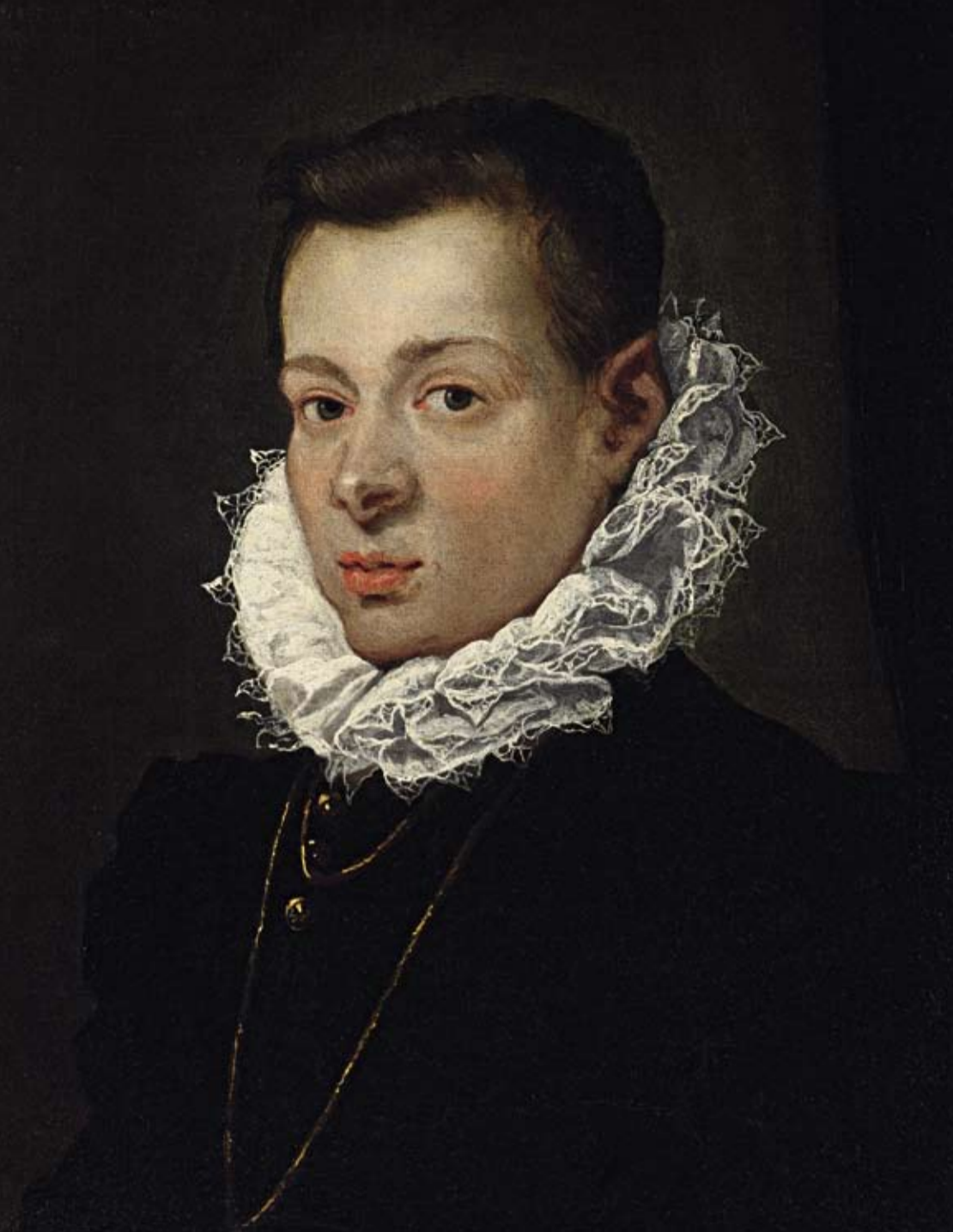
Ludovico Carracci (1555–1619), Portrait of a Youth wearing a Ruff , c. 1590, oil on canvas, 47 x 38 cm, € 50,000 – 70,000