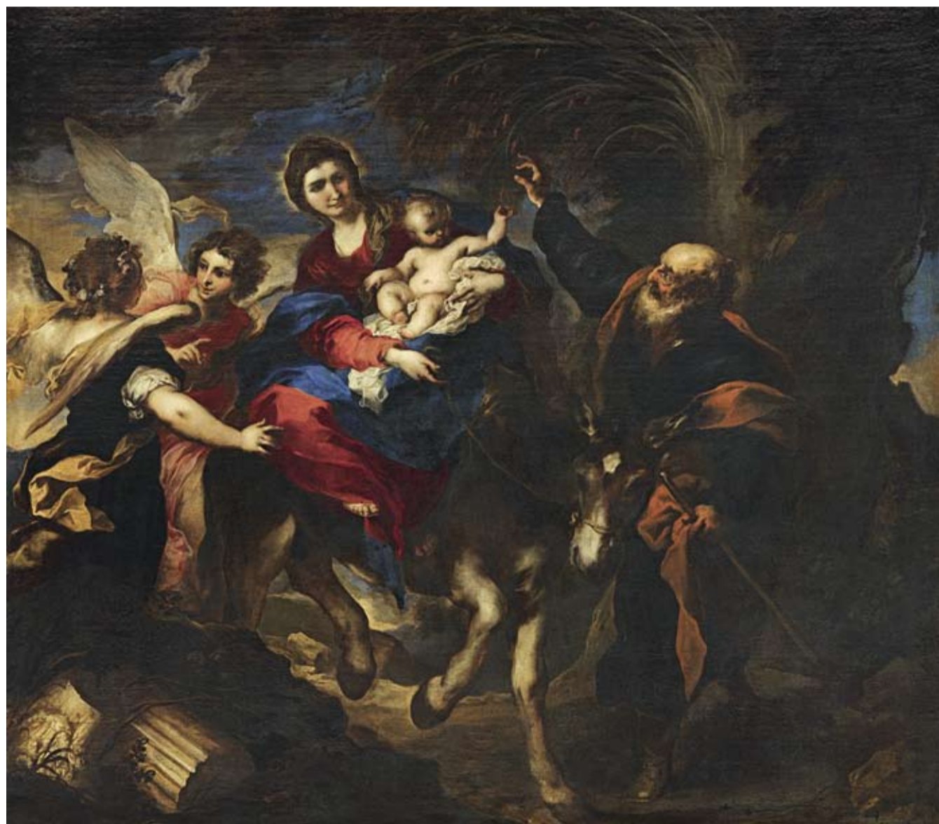
Valerio Castello (1625–1659), The Flight into Egypt, oil on canvas, 150 x 170 cm, € 200,000 – 300,000

A second focal point is provided by Flemish painting, including works by such prominent artists as van Dyck, Peter Paul Rubens with his Studio, Jan Brueghel the Elder and the Younger as well as Lucas van Valckenborch. Following the past year's world record Dorotheum sale of Frans Francken's dramatic insight into hell, the artist appears again with one of the auction's top lots: Demonstrating the Europe-wide pre-eminence of Antwerp painting during the first half of the 17th Century as well as an achievement of the greatest artistic perfection, one of probably the earliest Arcadias created north of the Alps represents the joint effort of several prominent members of the Antwerp painter's guild: Abraham Govaerts and his student Alexander Keirinx painted the forest and the ground while Frans Francken and his brother Ambrosius painted the figures.