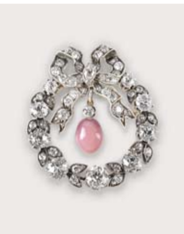
Conch pearl brooch, gold/silver, diamonds total weight ca. 3 ct, ca. 1900, € 4,200 – 5,500