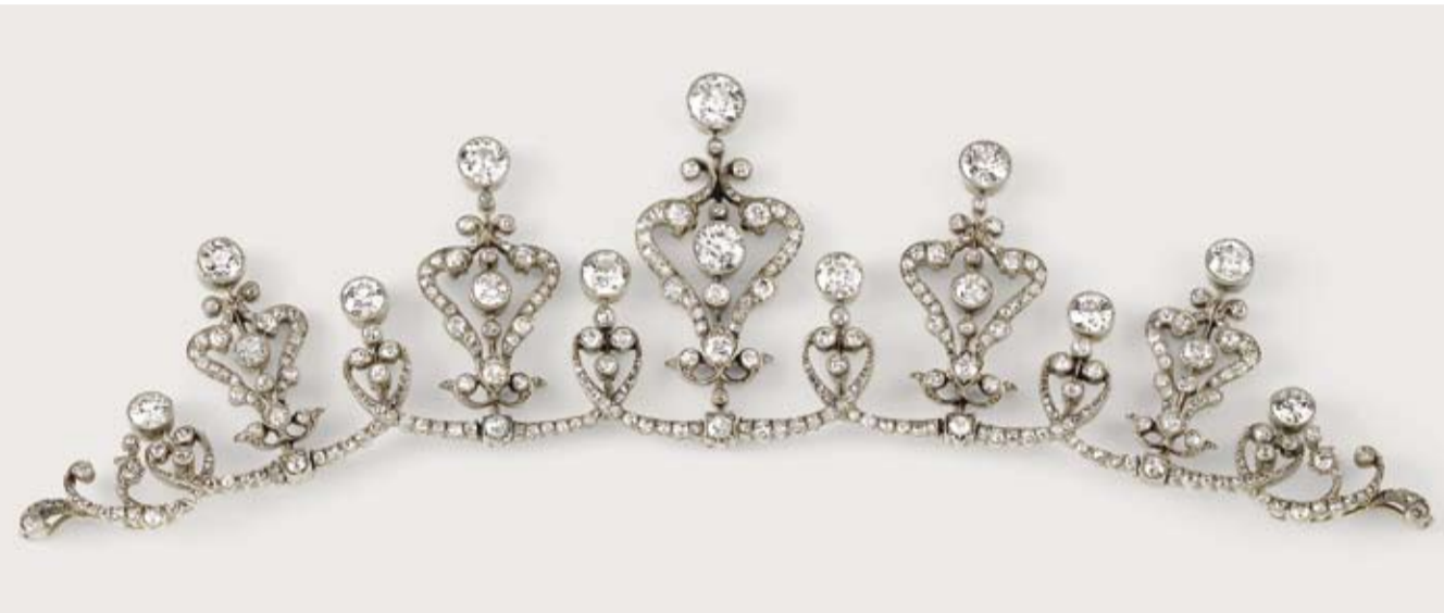
Tiara centre segment or collier, gold/silver, diamonds, total weight ca. 10 ct, off. Austrian hallmark 1872–1922, € 15,000 – 20,000