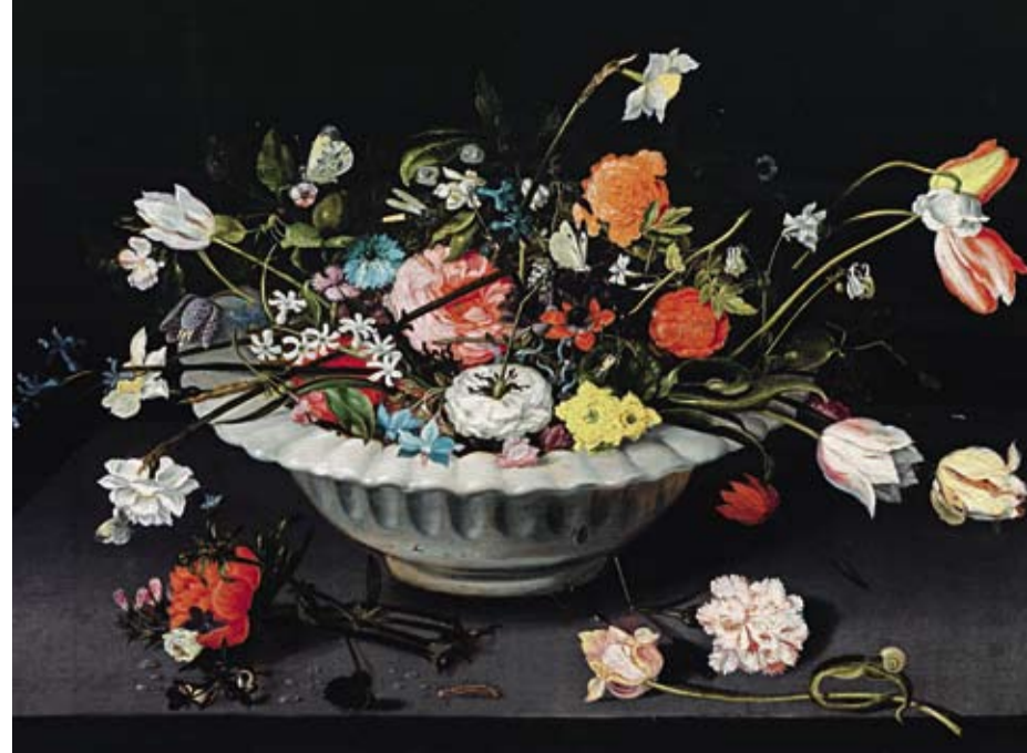
Jan Brueghel II (1601–1678), Still Life of flowers in a ceramic bowl , oil on panel, 48.5 x 65.7 cm, € 140,000 – 160,000