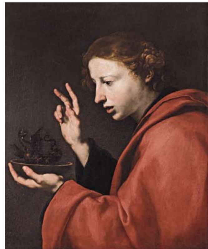
Jusepe de Ribera, lo Spagnoletto (1591–1652), St John the Evangelist , oil on canvas, 73 x 60 cm, € 150,000 – 200,000