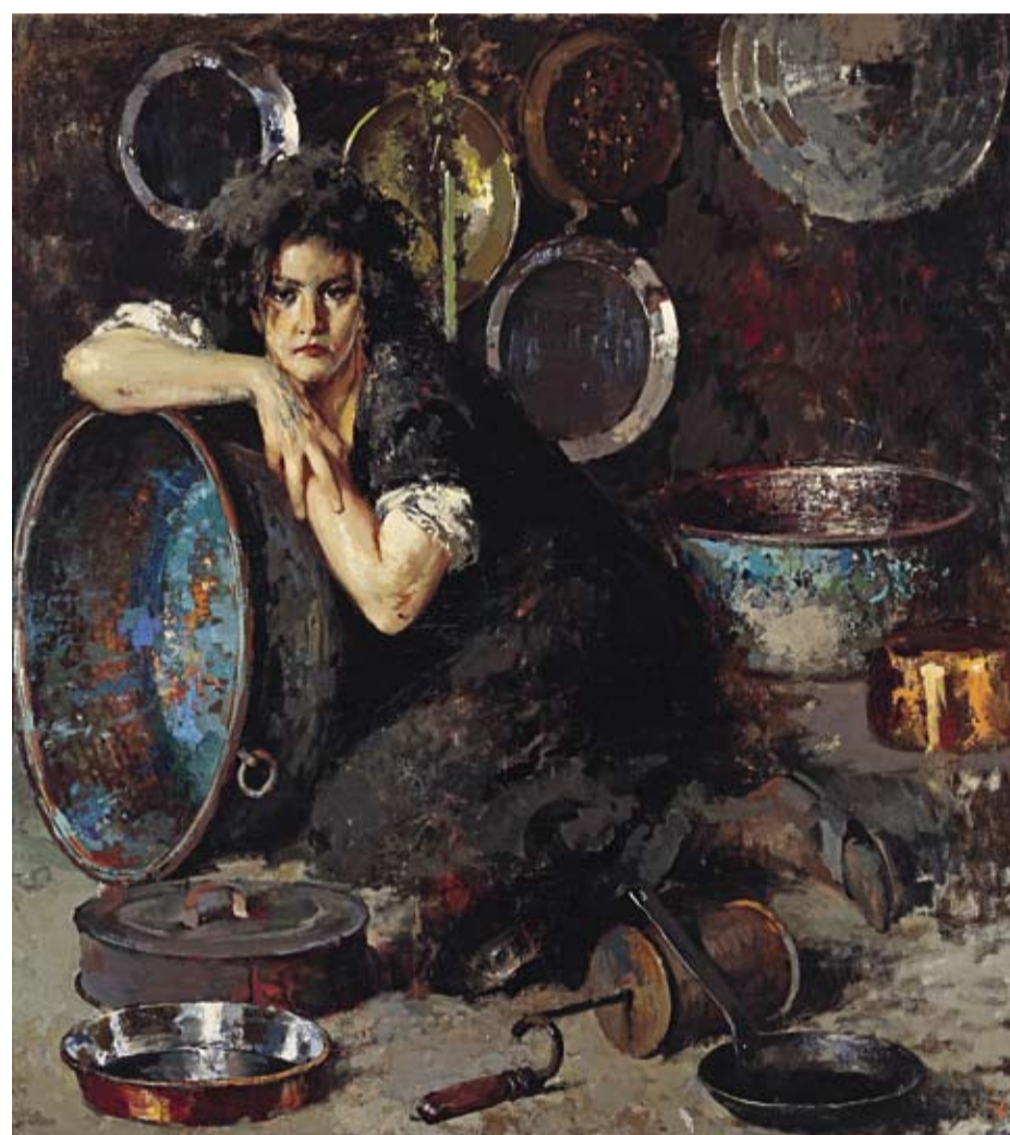
Vincenzo Irolli (1860–1949), A kitchen maid , oil on canvas, 135 x 125 cm, € 90,000 – 120,000