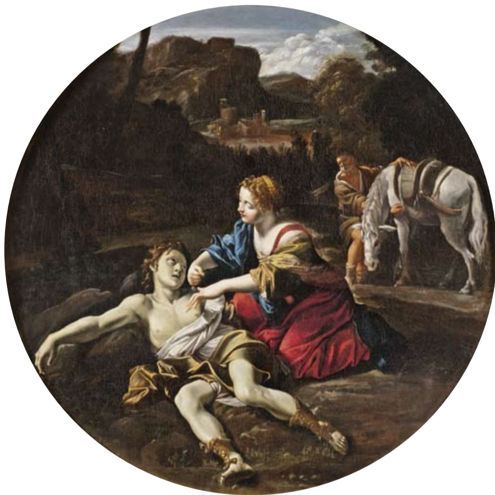
Giovanni Lanfranco (1582–1647), Angelica heals Medoro, oil on canvas, tondo Ø 110.6 cm, € 200,000 – 300,000