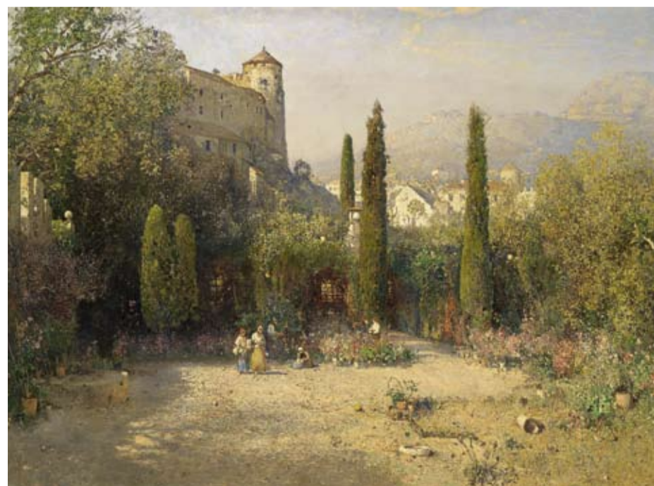
Robert Russ (1847–1922), "Gartenpartie aus dem Etschtal" (A garden party) , oil on canvas, 88.5 x 121 cm, € 40,000 – 60,000