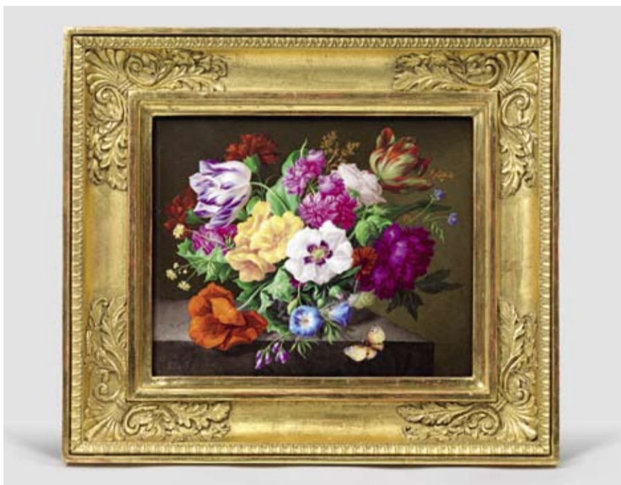
Josef Nigg, Porcelain Painting, Vienna, Imperial Manufactory, 1824, 17 x 21 cm, € 40,000 – 70,000