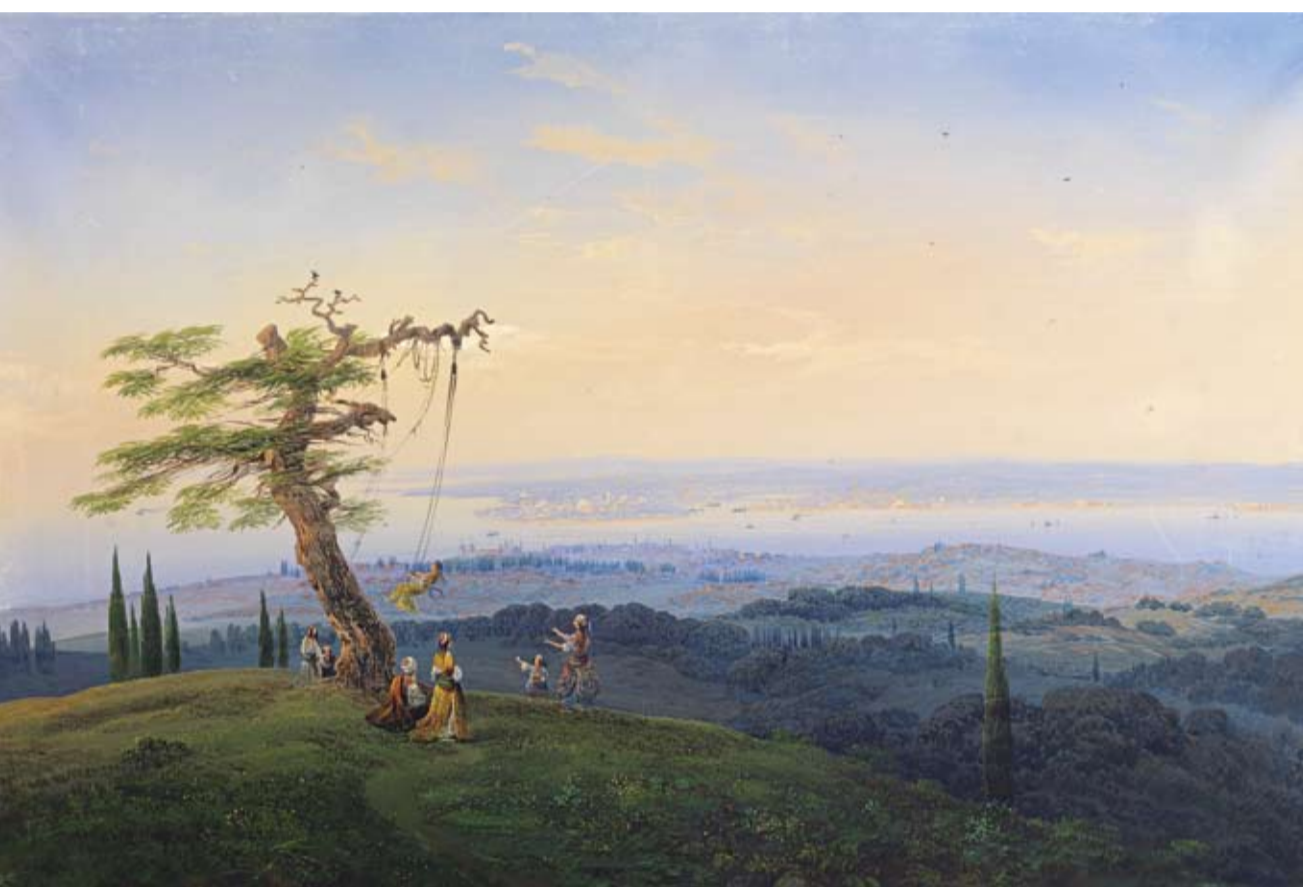
Carlo Bossoli (1815–1884), Evening Amusements outside the Gates of Constantinople , 1841, mixed technique on paper, 39 x 60 cm, € 40,000 – 60,000