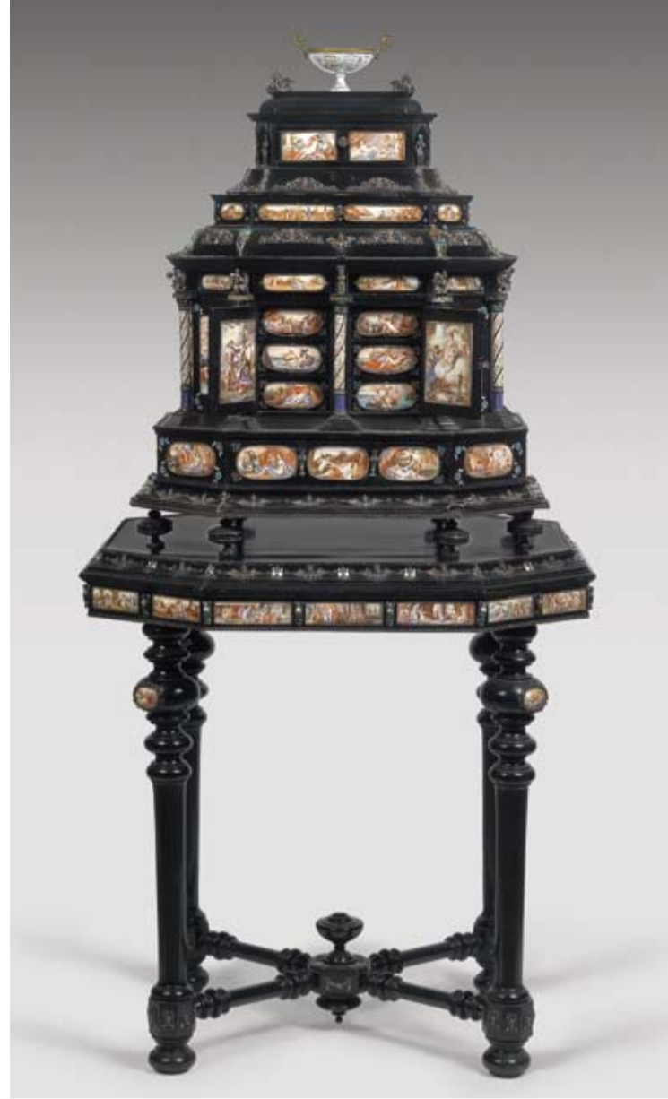
A Historism enamel cabinet, Vienna, 2nd half 19th cent., 150 x 75 x 65 cm, € 80,000 – 100,000