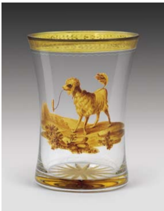
Kothgasser cup "L'obeissance", Anton Kothgasser, Vienna, ca. 1825, glass, height 10.5 cm, € 6,000 – 9,000