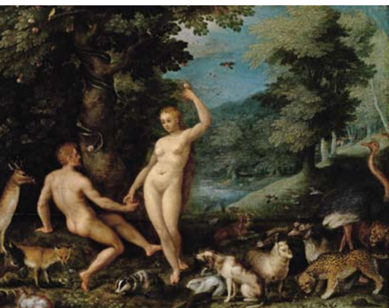
Jan Brueghel I (1568–1625), Paradise Landscape, with Eve's seduction of Adam, oil on panel, 36.5 x 47.5 cm, € 200,000 – 300,000