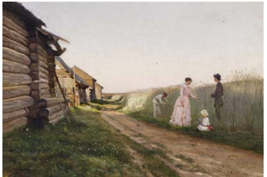
Joseph Krachkovsky (1854–1914), In the cornfield , oil on canvas, 37.3 x 54.5 cm, € 40,000 – 80,000