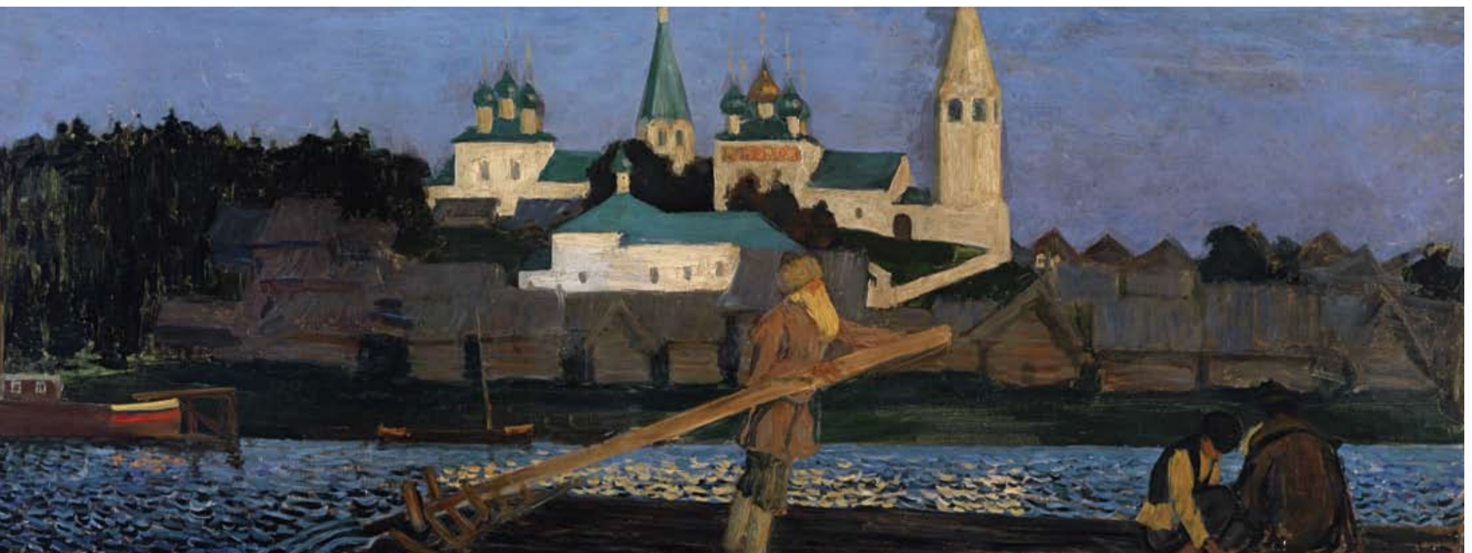
Boris Mihailovich Kustodiev (1878–1927), On the Volga , 1906, oil on canvas, 67 x 175 cm, € 350,000 – 500,000