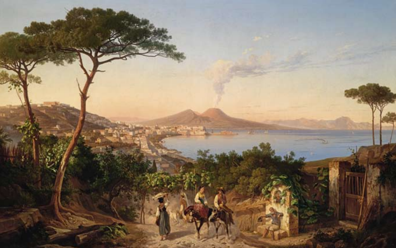
Carl Wilhelm Götzloff (1799–1866), View of Naples , 1862, oil on canvas, 85 x 131 cm, € 30,000 – 40,000