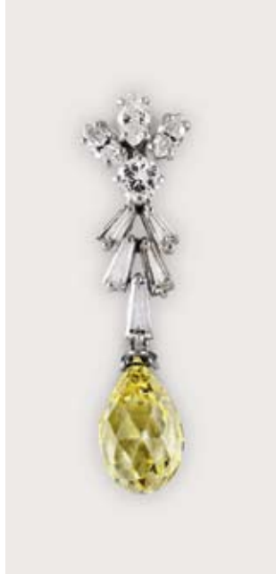
Fancy Briolette pendant, ca. 6 ct, platinum 950, € 20,000 – 30,000