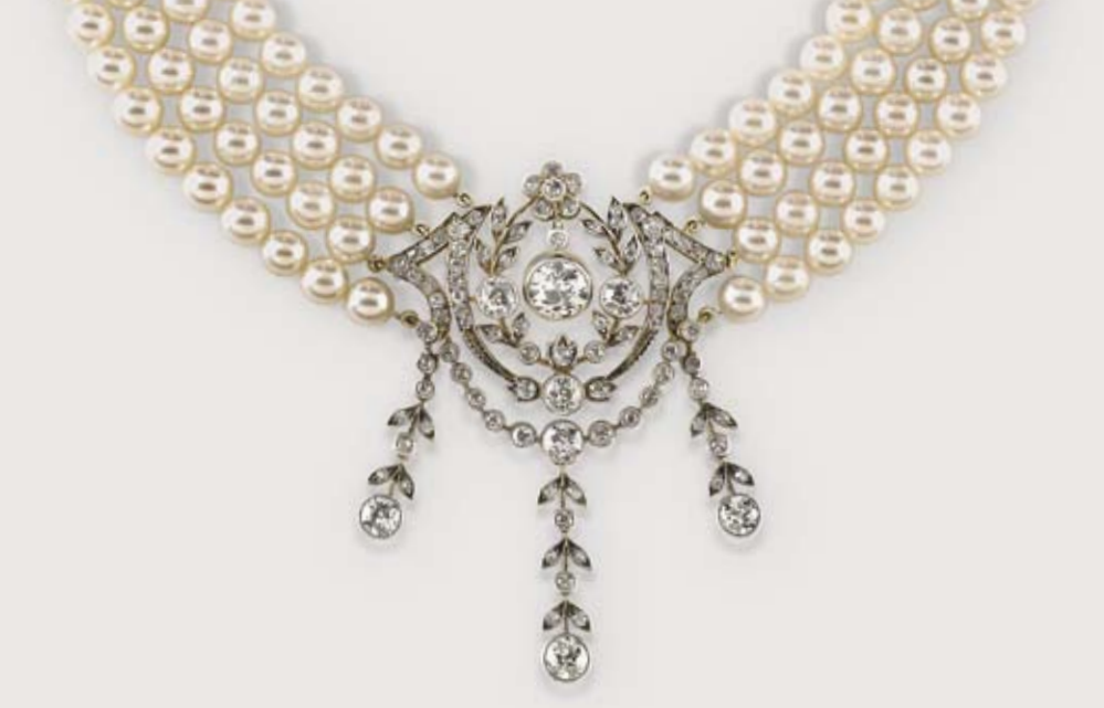
Necklace of cultured pearls, gold/silver, old-cut diamonds total weight ca. 8.30 ct, € 12,000 – 19,000