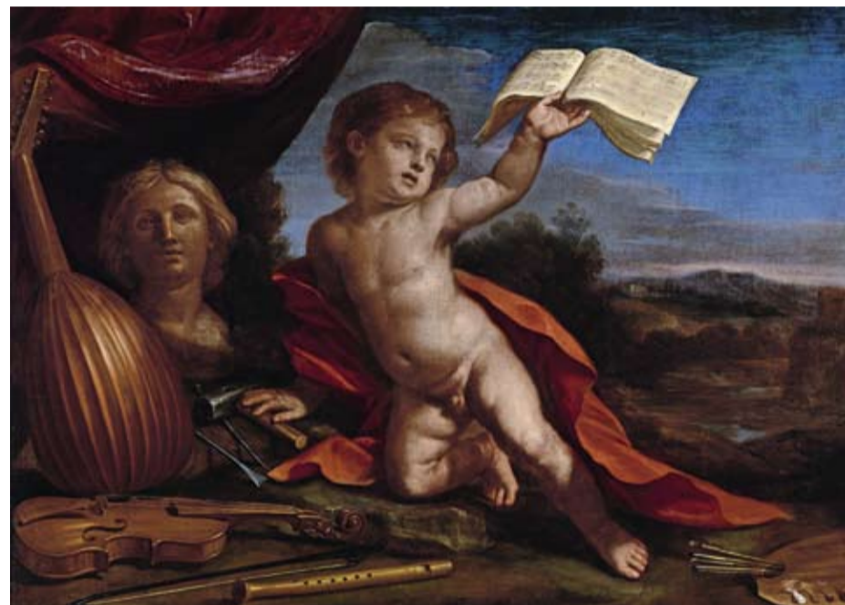
Giovanni Francesco Barbieri, il Guercino (1591–1666), L'Amore virtuoso , oil on canvas, 105.5 x 152.5 cm, € 400,000 – 500,000