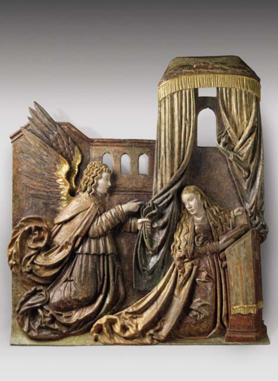
The Annunciation, relief, ca. 1520, limewood, polychromed, silvered and gilded, 92 x 102 cm, € 26,000 – 30,000