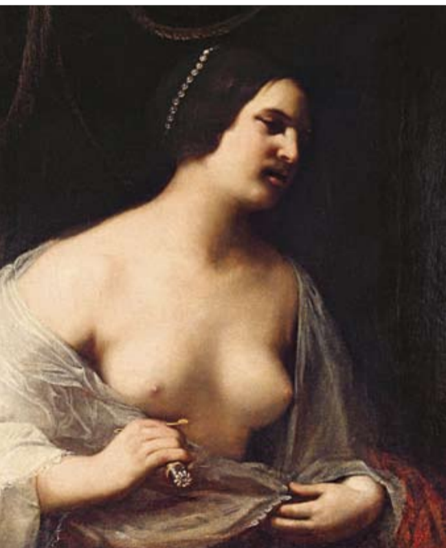
Guido Cagnacci (1601–1663), Lucretia , oil on canvas, 86.5 x 72 cm, € 80,000 – 120,000