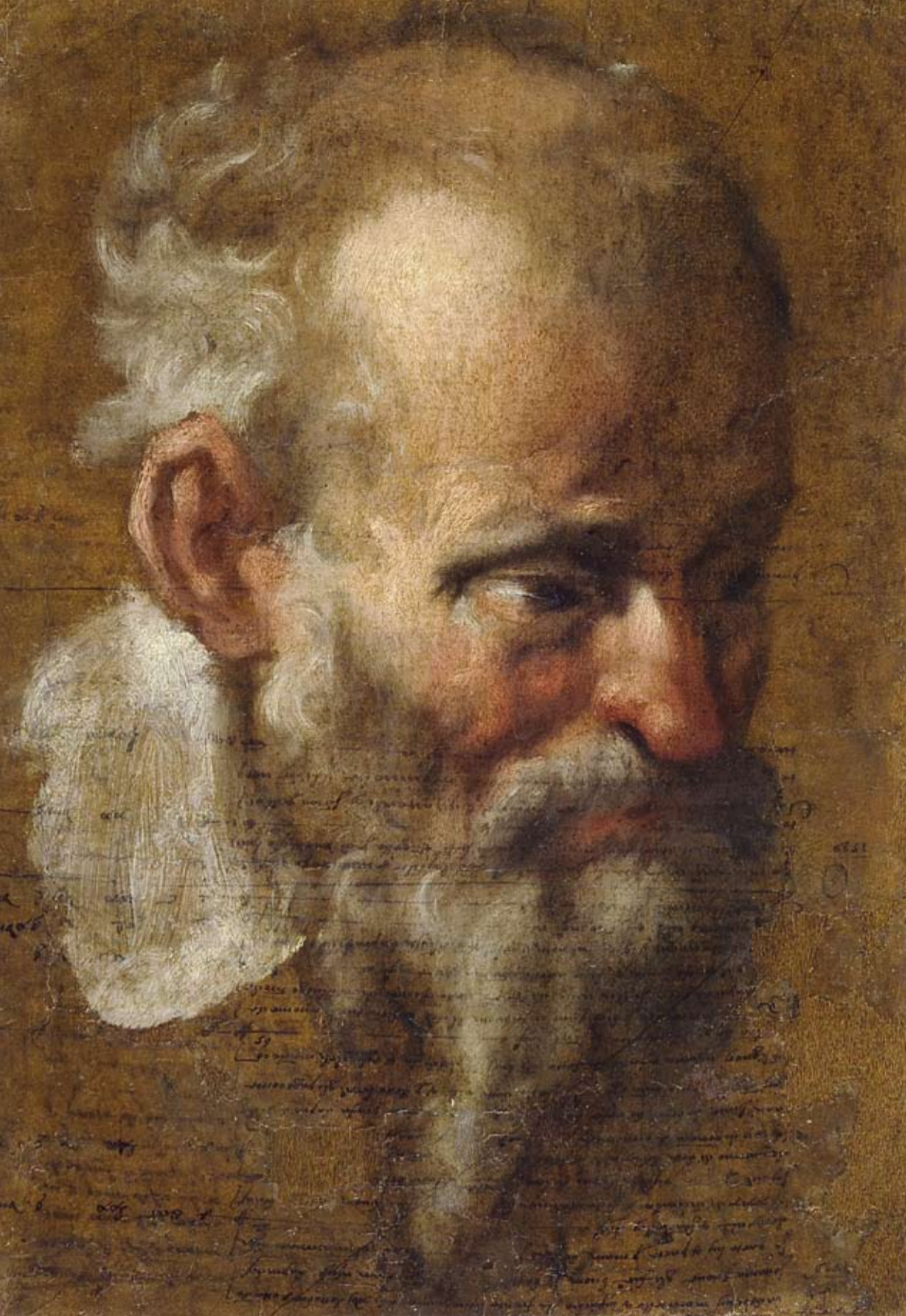
Annibale Carracci (1550–1609), Study of a bearded man, oil on paper laid down on canvas, 41 x 28.5 cm, estimate on request